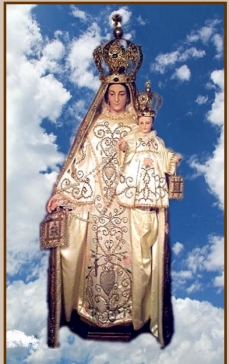
OUR LADY OF MOUNT CARMEL PRAY FOR US

A special thank you to those who have already contributed to the feast. We are grateful for your generosity.